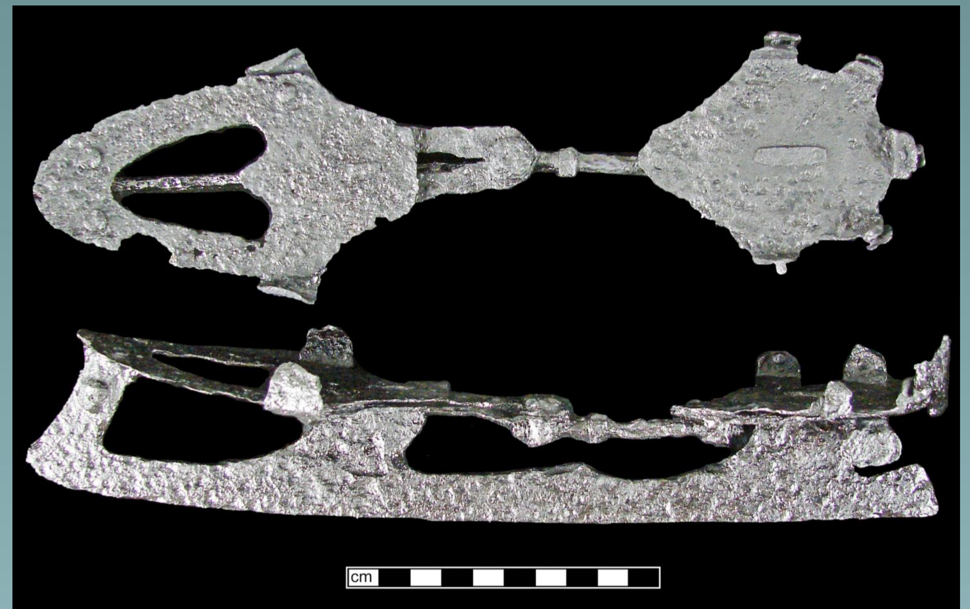
Ice skates from the Stoll-Heisel site, St. George's, Delaware.