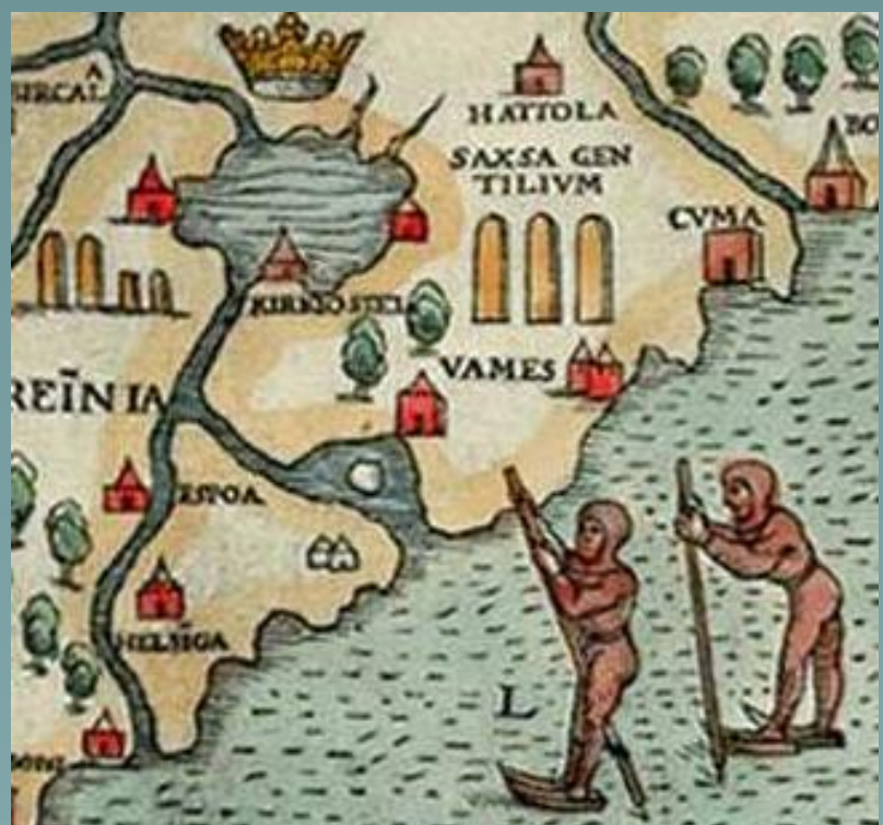
The 16th century map 'Carta Marina' by Olaus Magnus shows ice skaters using poles.

Bone skates gave way to wooden skates with metal runners by the 13th century. The sharper blade edge allowed skaters to propel themselves using just their leg muscles, while making it easier to turn and achieve faster speeds (Formenti and Minetti 2007). There is ample pictorial evidence that ice skating remained popular throughout the Middle Ages, and certainly during Europe's Little Ice Age (Formenti and Minetti 2007). 18th and 19th-century ice skates saw further technical changes – longer blades and purpose-made boots, both of which increased the control of the skater. Modern day ice skates may look a little different from these earlier models, but the basic idea has remained essentially unchanged for hundreds of years.