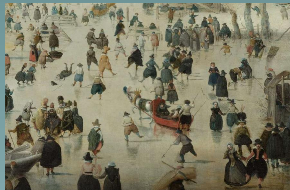
Detail from Winter Landscape with Ice Skaters by Hendrick Avercamp, c. 1608, Rijksmuseum.

Skating was an inclusive pastime from very early on. Prints and written records from as early as the 15th century indicate that activities on the ice were open to people of all ages, classes, and genders (Kestnbaum 2003). In colonial America, ice skating was commonplace, especially in New York, Delaware, and Pennsylvania, where settlers of Dutch and Swedish heritage kept up the traditions of their homelands (Struna 1996). Upon visiting New