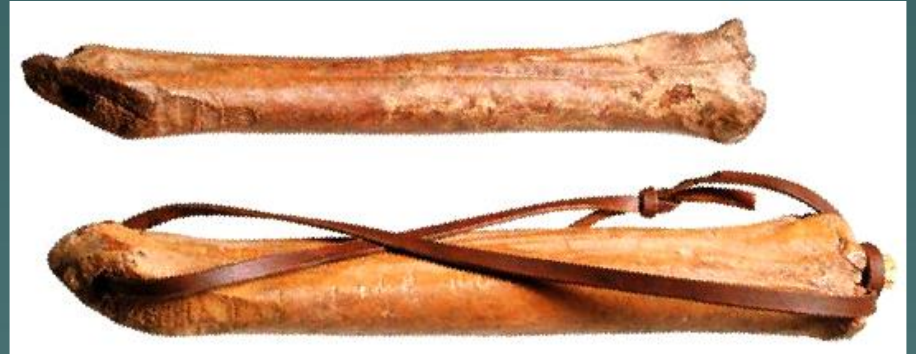
12th Century bone ice skates with reproduction leather straps, Museum of London.

York in 1678, English clergyman Charles Wooley noted, "And upon the Ice it's admirable to see Men & Women as it were flying upon their Skates from place to place, with Markets upon their Heads & Backs" (Gems et al. 2008). Americans continued ice skating in the 18th century, not just as a means of transport, but also for leisure. Alexander Graydon, a Philadelphia lawyer writes, "With respect to skating, though the Philadelphians have never reduced it to rules like the Londoners, nor connected it with their business like Dutchmen, I will yet hazard the opinion, that they were the best & most elegant skaters in the world" (Sarudy 2014). The opening of a skating pond in New York's Central Park in the winter of 1858-59 provided ample opportunity for unchaperoned intermingling of men and women. Unsurprisingly, the pastime continued to grow in popularity into the 20th century, and it remains a favorite wintertime activity today.